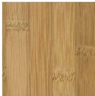
Flat Grain (Horizontal) Caramelized