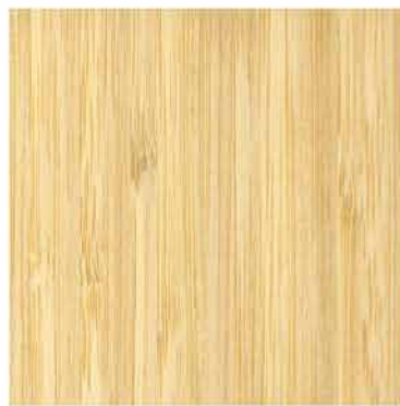
Edge Grain (Vertical) Natural