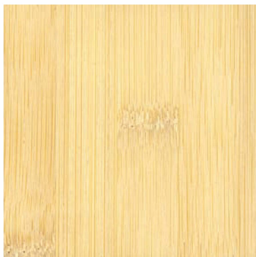
Flat Grain (Horizontal) Natural